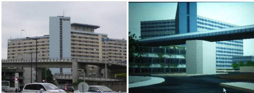
Fig. 1. Screenshots our real (left) and our virtual environment (right).

The real environment was a 9km 2 area. The VE was a 3D scale model of the real environment, with realistic and visual stimuli. The scale of the real environment was faithfully reproduced (measurements of houses, streets, etc.) and photos of several building facades were applied to geometric surfaces in the VE. Significant local and global landmarks (e.g., signposts, signs, and urban furniture) and urban sounds were included in the VE to make the simulation more realistic (see Figure 1). VE was laboratory-developed using Virtools Dev 3.5™. Irrespective of the interfaces conditions, the itinerary was presented to participants on the basis of an egocentric frame of reference, at head height. It was characterized by an irregular closed loop, 780 m in length, with thirteen crossroads and eleven directional changes.