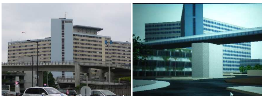
Fig. 1. Screenshots our real (left) and our virtual environment (right).

The real environment was a 9km 2 area. The VE was a 3D scale model of the real environment, with realistic and visual stimuli. The scale of the real environment was faithfully reproduced (measurements of houses, streets, etc.) and photos of several building facades were applied to geometric surfaces in the VE. Significant local and global landmarks (e.g., signposts, signs, and urban furniture) and urban sounds were included in the VE to make the simulation more realistic (see Figure 1). VE was laboratory-developed using Virtools Dev 3.5™. Irrespective of the interfaces conditions, the itinerary was presented to participants on the basis of an egocentric frame of reference, at head height. It was characterized by an irregular closed loop, 780 m in length, with thirteen crossroads and eleven directional changes.