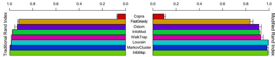
Fig. 3. Comparison of the results obtained with the traditional (left) and modified (right) versions of the (non-adjusted) Rand index.

The values obtained for the example of section 3 (as presented in Table 1 for the other measures) are respectively: 0.80 for the traditional version, 0.72 for the modified version applied to partition A and 0.88 for the modified version applied to partition B .