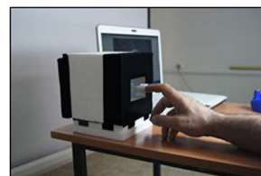
(b) Laboratory Prototype