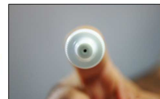
(c) Selected frame with moving index