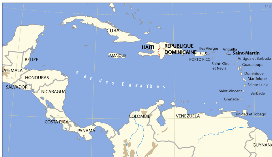
Figure 1 - Location of islands addressed in this article (Marie Redon/Geneviève Decroix)

How do insular identity and political otherness articulate around each other? How is each country defined by specific landscapes within the same island? The landscape will