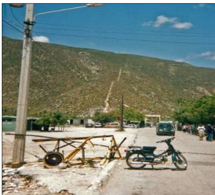
Figure 8 - Jimani-Malpasse border crossing station, Dominican side