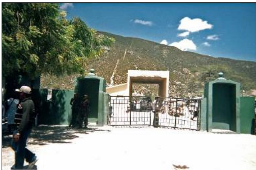
Figure 9 – Jimani-Malpasse border crossing station, Dominican side – official entrance (2002) - (author's photograph, 2002)