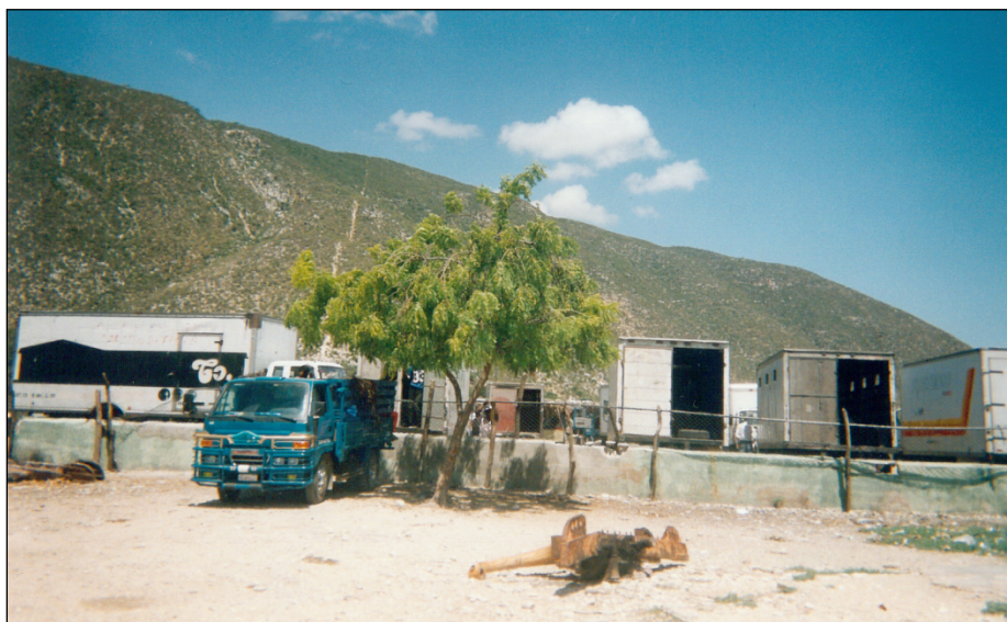
Figure 10 - Jimani-Malpasse border crossing station, Dominican side, a few metres to the left of the border in Figure 9, where the wall is not so impressive