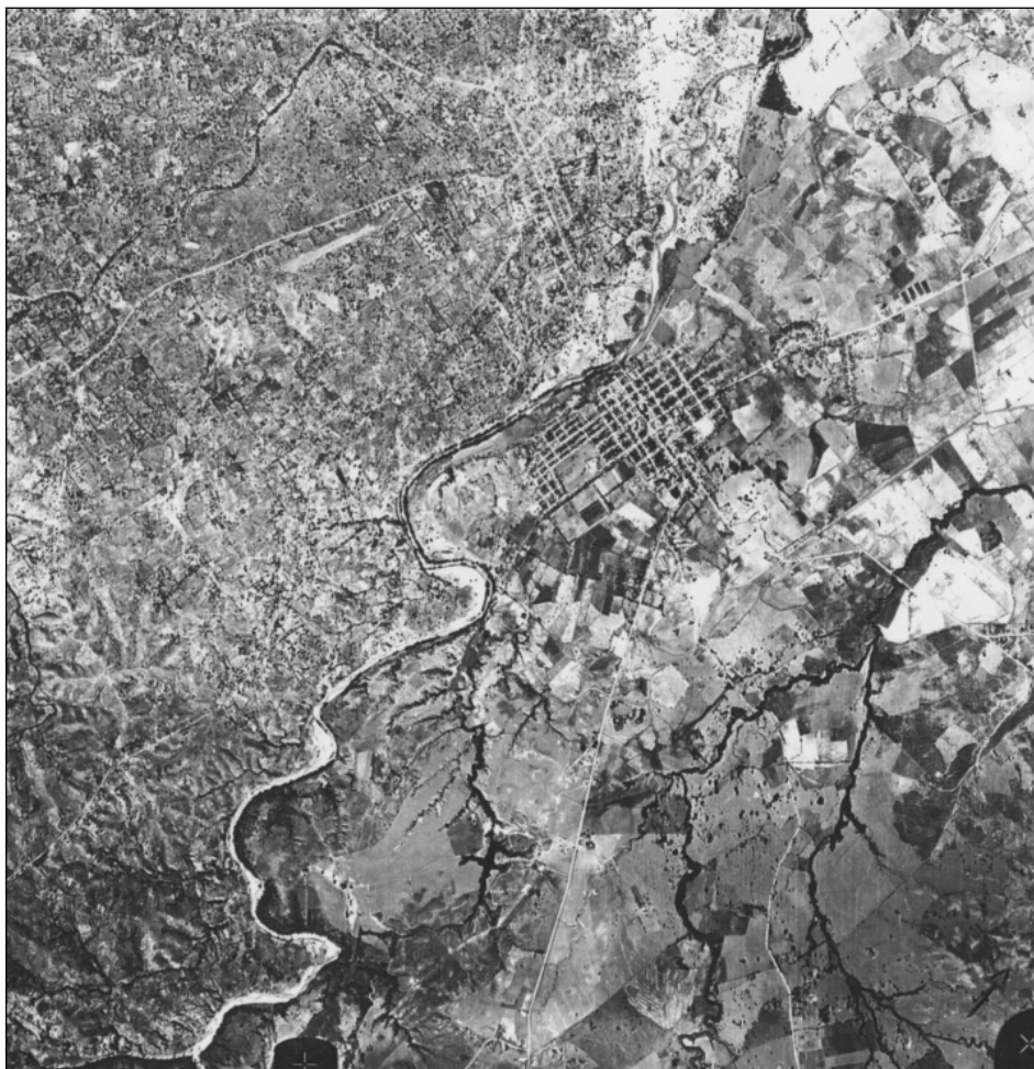
Figure 2 – Map of Dajabón landscape adjacent to Massacre River border, Quisqueya island

The key factor is the different land management resulting from the Andalusian-derived hatos system in Dominica, which is based on large cattle and horse breeding properties, and the intensive sugarcane plantations prominent in Haiti. As a result, the border divides the landscape between two visibly distinct approaches to space. Once the gold sought by early Europeans on Hispaniola island had run out, an economy based on agriculture and breeding was set in place. The first black slaves were introduced around 1500 but the colonists rapidly tried to limit the use of the servile work force in order to preserve the numerical superiority of the whites (with the first black insurrection occurring in 1522). If sugar and coffee cultivation implied an intense use of the work force, it wasn't the case for the hatos . The extensive breeding became the privileged