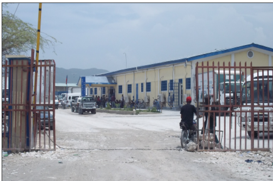
Figure 7 – Jimani-Malpasse border crossing station, Haitian side