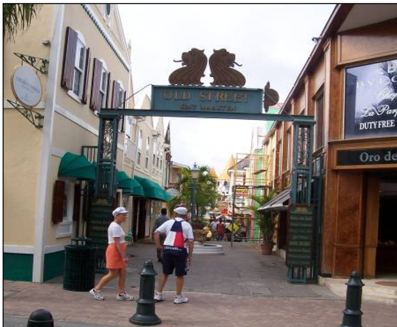
Figure 4- the streets of Philipsburg, Dutch side

On these two divided islands, the functional reading template shows that the contrast of the landscapes on each side of the insular border is inherent to the age and depth of the enhancements: in Quisqueya, the border grabs our attention, since the space has been modelled by distinct social and spatial systems; in Saint-Martin, the massive and recent inception of tourism has contributed to homogenised landscapes that were already very similar. The landscape appears here as a 'social product' variable according to the type of society which produced it.