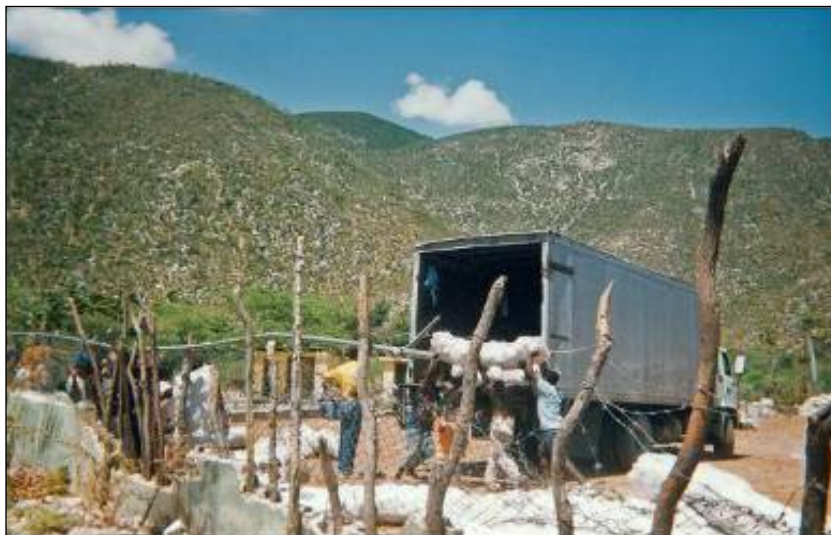
Figure 11 – Further along from Figures 9 and 10 – no wall anymore, just barbed wire and goods crossing (author's photograph, 2002)