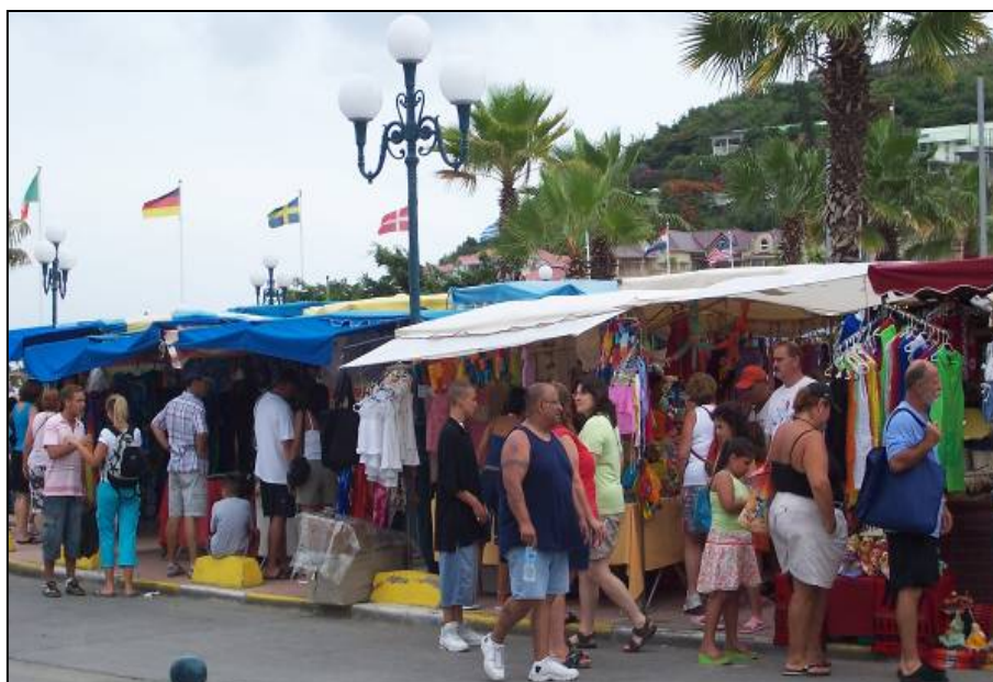
Figure 3 - the streets of Marigot, French side