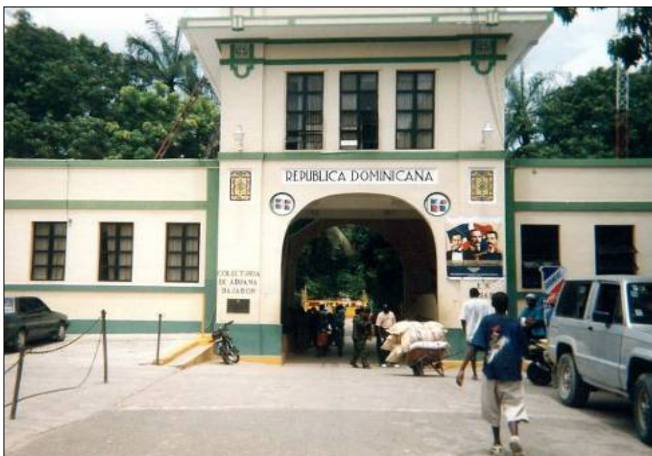
Figure 6 - Dajabón border station

Borders are places of contact between national territories, the place where the legitimate spatial hold of one state stops and the other begins. While this point of contact has been relatively unproblematic (and, indeed, folklorised) in Saint-Martin; the stakes are higher between Haiti and the Dominican Republic because of an often violent history of contact between the neighbours (Théodat, 2003). Bilateral relations are ambiguous today: on one side, the Dominican Republic shows a substantial benevolence toward its poor neighbour, which nevertheless represents a major commercial and economical partner; and on the other, substantial Haitian migration to the adjacent country has provoked tensions concerning the management of these migratory flows by the Dominican government. The number of Haitians living in the Dominican Republic, a country with a population of more than 9 million people, has been estimated as around one million people. The ambiguous relationship between these two states can be detected in the landscapes of the border (figures 6-8).