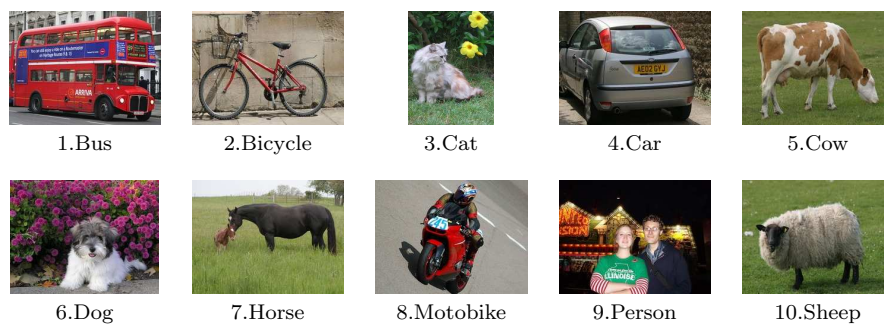
Fig. 1 Categories from PASCAL Visual Object Challenge (VOC) database, 2006.