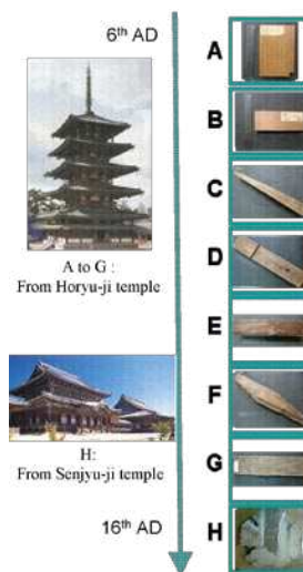
Fig.2 Aged wood samples from Japanese historical buildings.

The aged samples were Hinoki ( Chamaecyparis obtusa ) wood from Japanese historical buildings, mostly Horyu-ji temple in Nara. The specimens used in this study were cut from aged wooden members provided from the restoration sites, which were not reused. The appearance of the buildings and delivered each aged wood samples are shown in Fig.2. The modern wood used for comparison was taken from 360-years-old Hinoki ( Chamaecyparis obtusa Endl.) from Kiso, Japan was used. The tree was harvested in 1988 corresponding to annual rings from A.D. 1629 to 1988, and the wood had been dried for 18 years in ambient condition in shed.