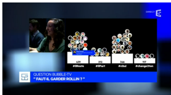
Figure 6: The community manager reporting Twitter activity.