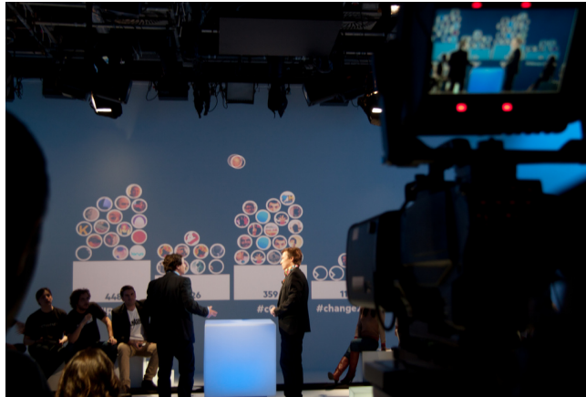
Figure 1: Integration of Bubble-TV as a background of the TV stage.

INRIA 91405 Orsay Cedex FRANCE Jean-Daniel.Fekete@inria.fr