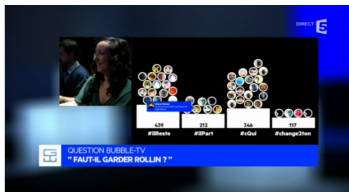
Figure 6: The community manager reporting Twitter activity.