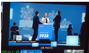
Figure 4: The Tweet counter embedded in the stage furniture.