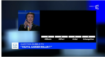
Figure 5: Speaker present and explain how the visualization will work.