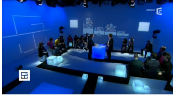
Figure 2: The stage with Bubble-TV as a background.