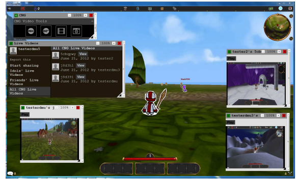
Fig. 3: Snapshot of the CNG P2P system.

A root of a Level 1 multicast tree ( r_1 and r_2 in Fig. 2) immediately forwards packets directly received from the source to the Level 2 multicast trees associated to it (one tree for r_1 and two trees for r_2 in Fig. 2). Moreover, as soon as it successfully decodes a source block, it sends an acknowledgment to the source, so that the source stops sending it packets, and it creates new encoded packets by applying rateless coding on the decoded source block. Then it sends these new encoded packets to Level 2 peers over the multicast trees associated to it (ignoring those already used). The number of packets sent