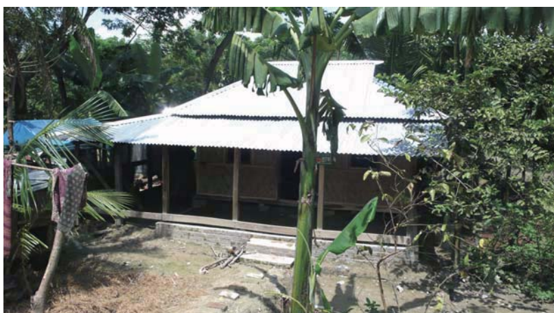
Fig.6 – Bangladesh: shelter provided by CB after cyclone Sidr, integrating features from the local building culture.

Through the contribution of local disaster management committees, CB proceeds to the definition and analysis of different homogenous territories, according to local risks, building practices, resources and social customs. For each of these defined areas, prevention strategies will be implemented and reconstruction programs will be reviewed by BUET and CB, with the design of low cost housing adapted local conditions.