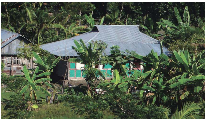
Fig.4 – Bangladesh: local architecture presenting features (pitched roof, natural wind breakers, high plinth) allowing for a better resistance to cyclones and floods

With technical support from CRAterre, a collaboration was then established between stakeholders working directly on the site and the Bangladesh University of Engineering and Technology (BUET), with the intention of improving the proposed solutions by deepening the study of local building cultures, associating them with some of the latest scientific results conducted on housing structures.