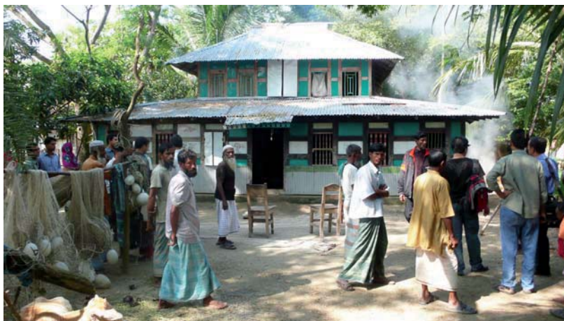
Fig.5 – Bangladesh: assessment of local constructions (credits: CRAterre, 2009).

Bangladesh is affected by many natural hazards (cyclones, floods, earthquakes), but it also offers great diversity in terms of building materials (bamboo, earth, wood), and the ways of life of its people. Standard solutions, both methodological and technical, would not lead to appropriate results adaptable to different contexts and populations.