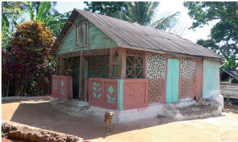
Fig.1 – Haiti, Cap Rouge: local architecture (credits: Annalisa Caimi, 2011).

Through this proposal, VEDEK aims to implement a longer-term vision regarding the identification of necessary technical improvements to reduce the vulnerability of buildings at risk in earthquake and hurricane prone areas, so that it may be integrated as part of current construction practices. SC/CF requested the assistance of CRAterre to support local partners in the process of evaluating needs, monitoring and determining constructive principles based on solutions adapted to local risks, potentials and capacities.