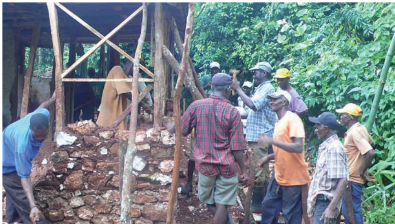
Fig.2 – Haiti, Cap Rouge: training of local masons for housing repair (credits: CRAterre, 2010).

The development of local expertise in the field of construction in risk-prone areas was provided through training sessions aimed at local craftsmen from all over the region of Cap Rouge, making their new skills available to the whole population. Damaged houses were used as support for the explanation of the techniques that the artisans then put into practice on their own. Meanwhile, a sensitization campaign aimed at building professionals and the general public was conducted through radio broadcasts, site visits and meetings with project stakeholders.