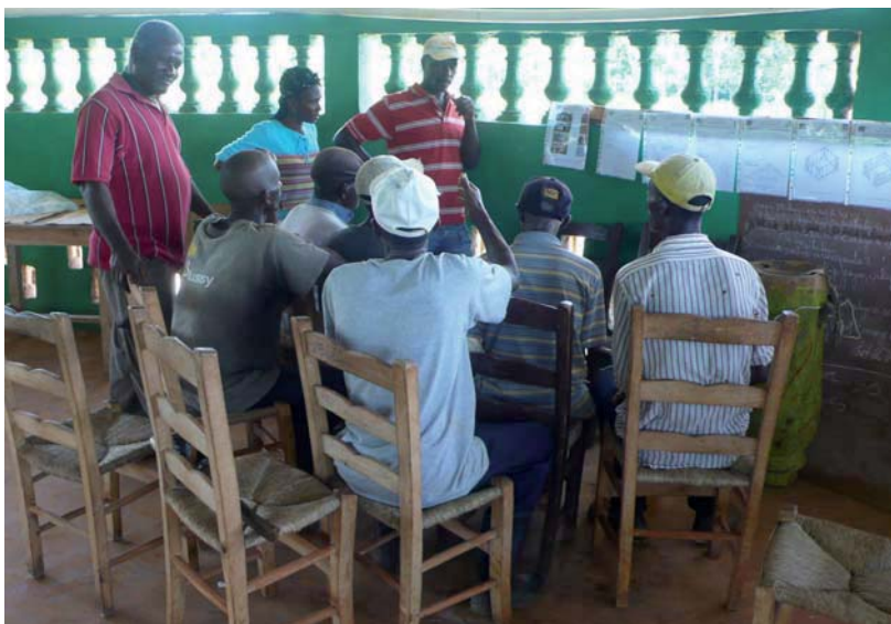
Fig.3 – Haiti, Cap Rouge: creating public awareness.