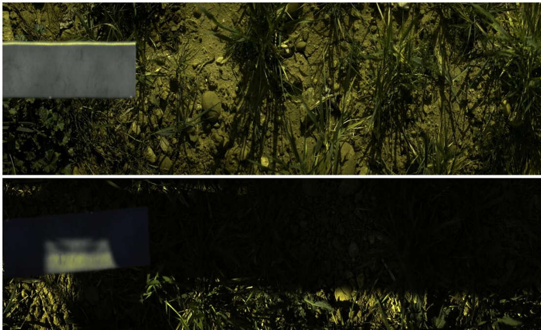
FIGURE 1: Two reflectance images in false RGB colours with different lightning conditions without shadow (up), with shadows (down). On the left : the ceramique plate.

In Fig. 1, two hyperspectral images are shown with false colours, i.e. using 3 bands respectively at 615, 564 and 459 nm as R, G, and B channels. These images illustrate the difference in lightning conditions we have to face in the following.