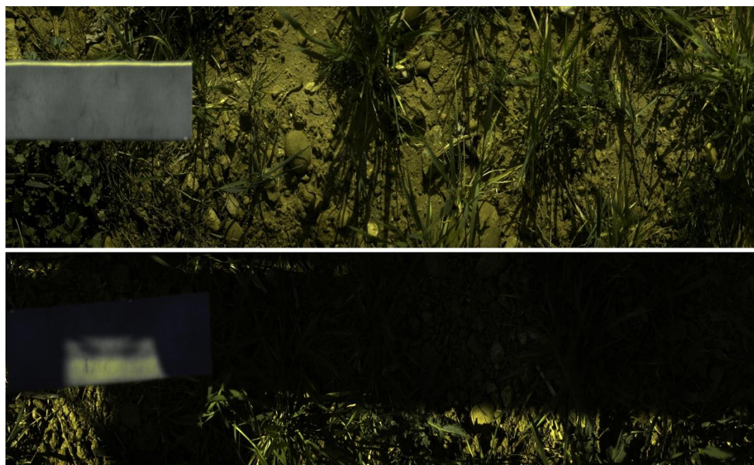
FIGURE 1: Two reflectance images in false RGB colours with different lighting conditions without shadow (up), with shadows (down). On the left : the ceramique plate.

In Fig. 1, two hyperspectral images are shown with false colours, i.e. using 3 bands respectively at 615, 564 and 459 nm as R, G, and B channels. These images illustrate the difference in lightning conditions we have to face in the following.