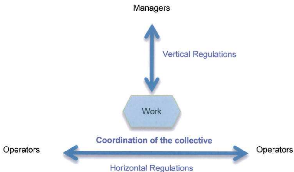
Figure 3: Horizontal and vertical regulations

Lastly, in order to be effective, these two types of regulations have to be based on real aspects of the work concerned.