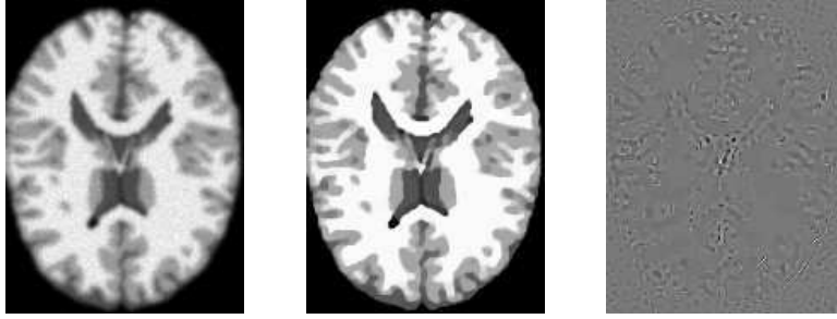
Fig. 4. Result for the 'brain' image B2 1 200 corresponding to Table 3. Corrupted image (left), restoration result by the Anscombe constrained model and Alg. 1 (middle), difference image between the middle image and those denoised by the I -divergence constrained model and Alg. 2 (right). The gray values in the difference image are between -15 and 15, while the image values were scaled up to 1200.

intensities. As expected, we observe that the outcomes of the two algorithms are very similar. More precisely, if u_A , resp. u_I denote the output of the restoration procedure with Anscombe, resp. I -divergence constraints, then we get for image B1 that \|u_A - u_I\|_2/(\nu n) ranges from 2.24e-6 to 6.76e-7 and \max |u_A - u_I|/\nu from 0.0082 to 0.0026 for the different noise levels.