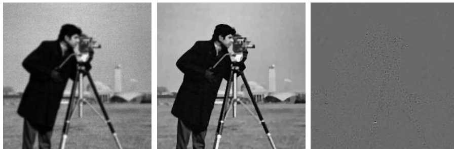
Fig. 3. Result for the 'cameraman' image B1 1200 corresponding to Table 3. Corrupted image (left), restoration result by the Anscombe constrained model and Alg. 1 (middle), difference image between the middle image and those denoised by I -divergence constrained model and Alg. 2 (right). The gray values in the difference image are between -10 and 10, while the image values were scaled up to 1200.

We computed the minimizer of our functional (1) with the l_{2,1} -norm \Phi and the discrete gradient operator L by Algorithm 1 with \tau = n . We compared the result with the I -divergence constrained approach (4) and Algorithm 2 with \tau_I = n/2 . The parameters \sigma and \tau appearing in the PDHGMP are fitted such that the algorithms give (up to two digits after the comma) the same PSNR, MAE and TV-norm (times 10^5 or 10^6 ) after 1000 iterations as after 100000 iterations. In the I -divergence constrained approach with the brain data we stopped after 5000 iterations. Further we have chosen \theta = 1 . Fig. 3 shows the restoration results for B1 1200 and Fig. 4 for B2 1200 . Table 2 summarizes the results for the different