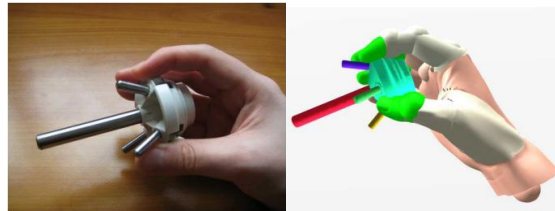
Figure 2. Configuration of a real/virtual hand for object grasping.