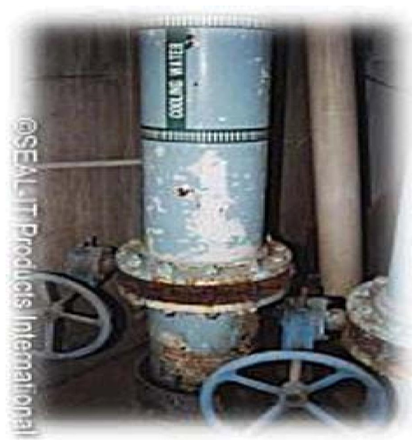
Fig. 3. Crevice Corrosion in a Flange

Is shown one Makconomi graph. This graph shows useful effects of Corom steels that stain less steels that have 12% Corom show no erosion. Erosion in more than 455 temperatures will decrease and this is related to sulphur combines and production of protective CoCa layers.