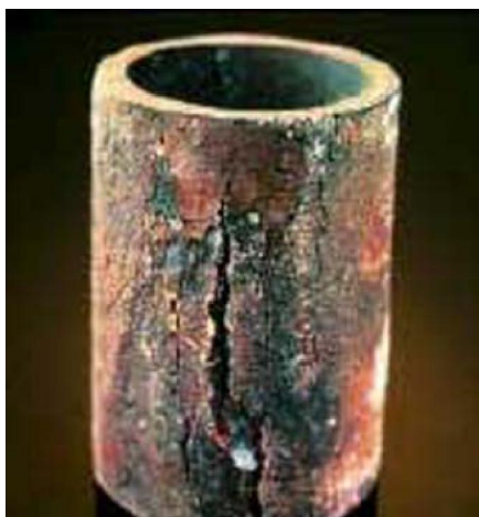
Fig. 1. Hydrogen Blistering

High temperature erosion: This erosion in refining is very important equipments usually high temperature analyze. In high pressure some of equipments near to hydrocarbon steam may be catch fire. High temperature erosion generally is related to sulphid combines with crude oil erosion with different sulphid combines in temperature between 260 to 540 is one of the common problem in oil refining. Play sulphid, hydrogen sulphid and hydrogen sulphid. Sulphid erosion in high in temperature increases. According to the situation, monotone us erosion, cavity erosion, rubbing erosion will happen. Erosion control depends to sulphid supportive film that is grown as Para bulk. Generally, Nickel and Nickel Ali yazh, Attack very quickly with sulphid combines but Corom steels in these situations has more resistance (such as aluminum) hydrogen sulphid and hydrogen combines are more active and generally stain less steels are more suitable in these situations. For prediction of crude oil erosion we use Economies. These graphs are according to sulphur Economies on process's changes in erosion.