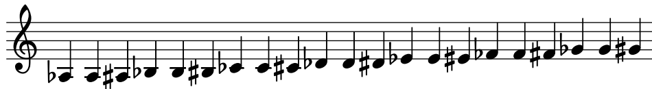
Fig. 1. The 21 generated notes

XMG builds a description for each case it tries (if all unifications succeed). As expected, the execution of the class Note (with 7 notes and 3 accidentals) leads to 21 descriptions.