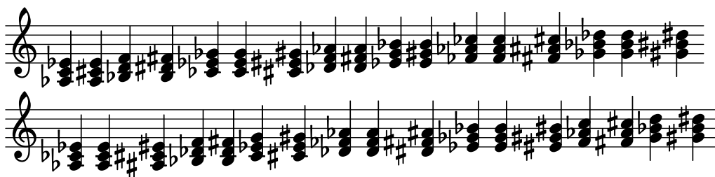
Fig. 4. The 17 generated major and minor triads

Major -> Third=Mthird[]; Fifth=fifth[]; Tonic=Third.First; Tonic=Fifth.First; Third.Root=Fifth.Root; ThirdN=Third.N; FifthN=Fifth.N; Root=Third.Root