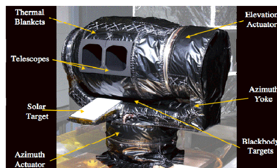
Figure 1 – The MRO/MCS instrument during thermal vacuum testing at JPL

EMCS is a copy of the Mars Climate Sounder (MCS) instrument on the Mars Reconnaissance Orbiter (MRO) spacecraft [1], with low impact modifications to 2 of 9 spectral filters and for interfaces with the proposed EMTGO spacecraft. MCS is now in its 5 th year of returning atmospheric profiles from Mars [2]. EMCS is an infrared, limb