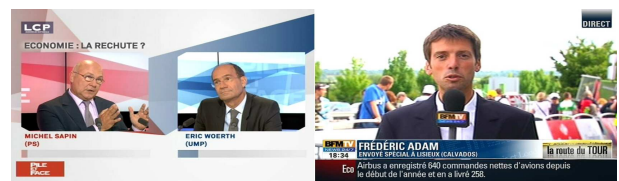
Figure 1: Two sample screen shots

ing the true speaker name for at least some of the clusters. A first system using automatic speech transcription (ASR) and manual rules for extracting speaker names from the transcription was proposed in [1]. An evolution of this approach using semantic classification trees (SCT) was presented in [2]. Both methods detect named entities in the ASR and use linguistic information to find the true name of a speaker. However, the frequent errors in the automatic transcription of proper names limit this approach. To prevent this issue, [3] combined subtitles and manual audio transcripts for face recognition in TV series. These sources of information can be found in TV series or movies, but generally not in news or talk shows. Automatic transcription of overlaid texts can provide names information with a high reliability (see figure 1). Indeed, TV broadcast news, reports or talk shows often use an overlaid text to introduce a person. In this paper, we address an unsupervised speaker identification method in videos with the help of overlaid texts obtained via video OCR. The core aspect of this approach is that no a priori speaker models are needed. Only speaker diarization and video OCR technologies are used.