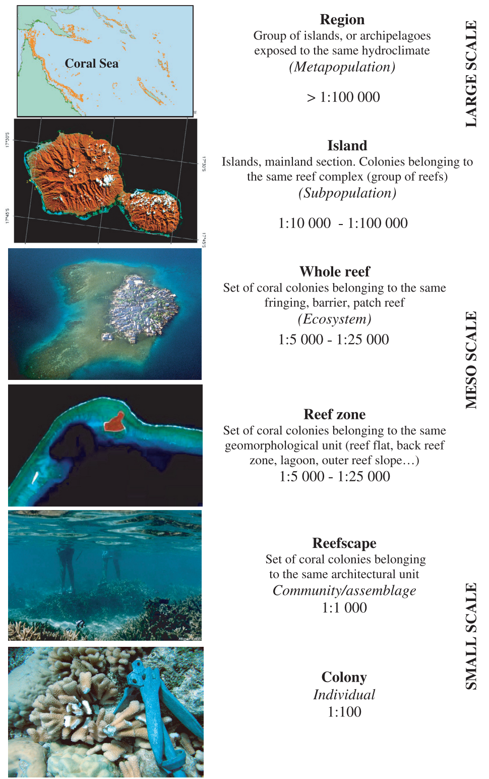
Fig. 1. Multi-scale presentation of coral reef habitats. For each spatial scale (on the right), the spatial pattern (in bold), the ecological function (in italic) and the representative scale are mentioned. Pictures illustrating the small and meso-scales present some related human-induced physical disturbances. Namely, coral colony debris due to anchoring, fishermen walking on a branching coral dominated lagoon reefscape in La Reunion Island, crater generated by atmospheric nuclear blast on the inner slope of the rim of Bikini atoll (Marshall Islands) and land filling of a patch reef flat using coral colonies from the forereef of the same reef in San Blas island (Panama). Island-scale is illustrated by Tahiti island where coastal barrier reefs and fringing reefs are dominant. Region scale is illustrated by the Coral Sea basin which is rimed by the major reef systems of the western Pacific (in orange, incl. New Caledonia, Vanuatu, Salomon Islands, Papua New Guinea and the Great Barrier Reef of Australia. Map source: Reefbase).