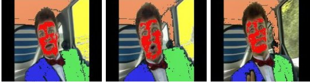
Figure 6. Illustration of video matting

perfect, they are very promising since we have not optimized the parameter settings yet. Let us precise that only 70% of the image content is analyzed (the insignificant nodes are removed). We can thus modify the PM measure to deal with such an incomplete segmentation, leading then to a new PM value of 87%. Of course, manual tuning of the parameters may lead to better results on some images, e.g. up to PM equal to 97% in our experiments.