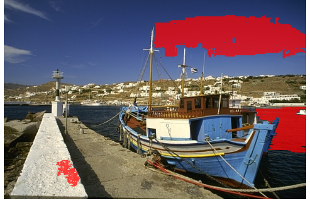
Figure 1. A sample image with 3 selected objects.

Steps are observed when increasing \alpha value leads to a high growth of the \alpha -zone area. In other words, the region