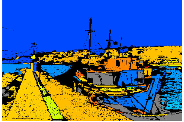
Figure 5. Illustration of automatic image segmentation

In order to evaluate the original segmentation method proposed in the previous section, we have conducted a set of experiments, which will be presented here. But first, we discuss how to set the different parameters involved in our algorithm.