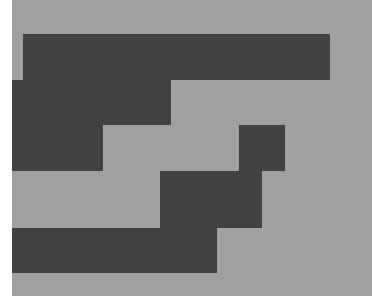
Figure 2: A \mathbb{F} -Budan table of a generic polynomial