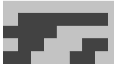
Figure 1: A truncated table with multiple roots

The proof is purely combinatorics and is exactly the same as the one given in [12] for the usual derivatives and the usual Budan tables.