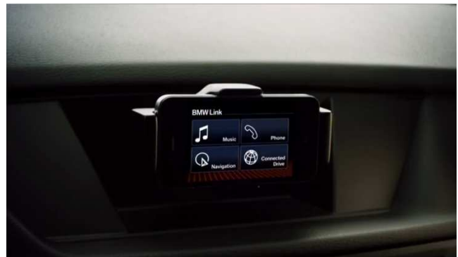
Figure 1. Integration of last generation mobile devices in automotive environment rise the necessity to analyze gestural interaction technique from their cognitive load point of view [?].

Last generation mobile devices are enhanced with a diversity of sensors capable of probing real world physical properties in real time. The pioneering work on sensor-based interaction techniques [8, 11, 12, 15, 16] has paved the way for an active research area [1, 20, 21]. Although these results satisfy “the gold standard of science” [19], in practice, they are too “narrow truths” [4] to support designers decisions and researchers analysis. Designers and researchers need an