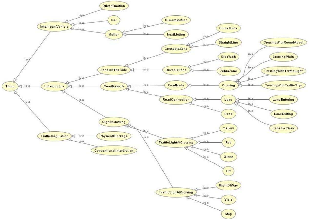
Fig. 2: Ontology for relaxing traffic regulations, as represented by GraphViz.

In our representation, two main properties of a vehicle must be inferred: the “ isOn ” property specifies an individual of the infrastructure on which a vehicle is (e.g., a named lane); and “ hasMotion ” / “ hasNextMotion ” object properties relate a vehicle to an individual of the “ Motion ” class. For now, the possible motions of a vehicle are set by individuals of this class (see Fig. 1): “ Forward ”, “ Stopped ” and “ Backward ” --- this discretization of the speed of a vehicle can be made as precise as desired, e.g., with integers representing a value in km/h.