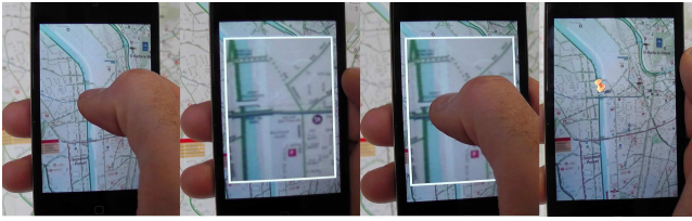
Figure 4: AR TapTap: First tap (left) to freeze and zoom the video (center); Second tap to place the mark (center) and automatically close the frozen and zoomed view (right).

Inherited from TapTap, the interaction is very fast, making it practically like a transient (or temporary) transition. The first selection tap provokes a transition along the axis Spatial mapping with the physical world (from conformal to none in Figure 2). The second tap for placing a mark also terminates the frozen and zoomed view returning thereafter to the initial state along the axis Spatial mapping with the physical world (i.e., conformal mapping - live video playback). In order to allow accurate placement of marks, AR TapTap therefore implements an explicit modification of the spatial mapping between the physical world and its representation with a first selection tap. This modification is transient since the second selection tap is not dedicated to changing the current mode (from none to conformal in Figure 2) but rather to placing a mark. As such, with AR TapTap, the frozen mode is only maintained for one mark placement. On the one hand, by placing the mark, the user also modifies the spatial mapping between the physical world and its representation : It is therefore a transient mode since no extra action from the user is required to explicitly change the mode. On the other hand, an additional third tap in order to change the mode after placing the mark would be a case of explicit transition between two sustained modes as in [10, 18, 7].