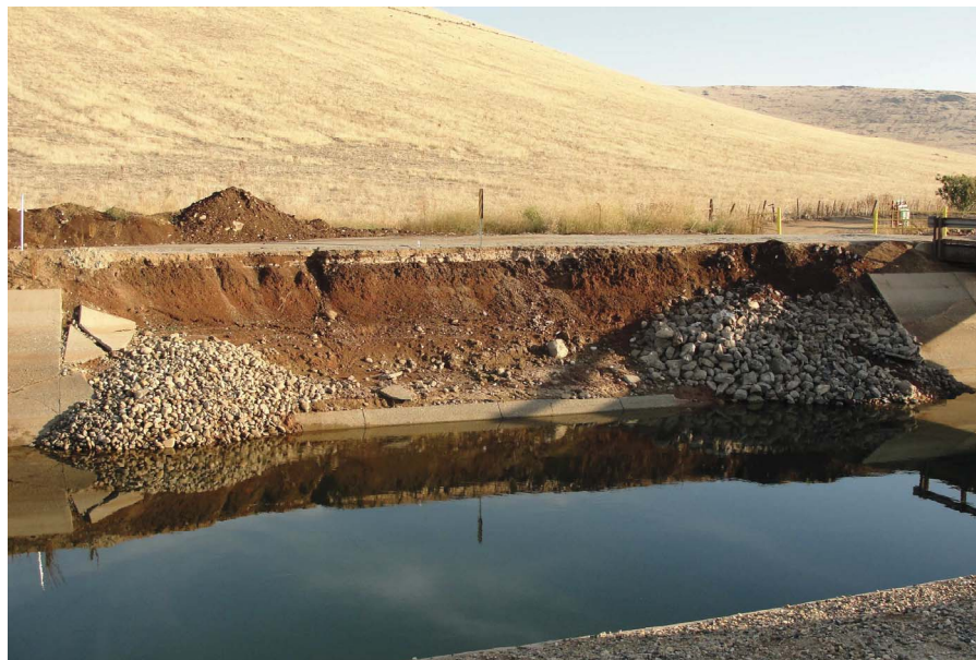
Figure 1: Concrete lining failure on the Friant-Kern canal (Nov. 2010).

Of the 87 km of canal built with Porterville clays, 37 are earth-lined and 50 concrete-lined. Failures have occurred in both sections, and began only 3 years after construction. Cracks, sliding and sloughing of slopes have been a continuing, expensive maintenance problem. In the concrete-lined sections, the swelling of the clay foundation caused many of the concrete panels to crack with “pop-outs” of blocks or even slides of entire concrete panels (Figure 1, picture taken in November 2010).