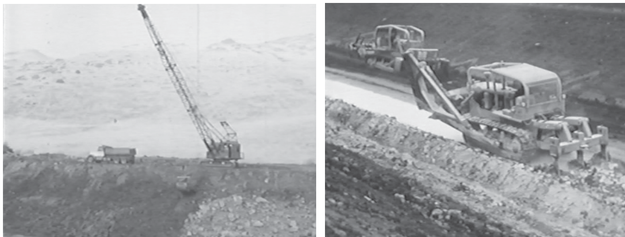
Figure 3: Devices used for removing the failed material from the banks (left) and for soil-lime mixing (back ripper, right).

The first stage of the program was to rebuild the service roads along the top of the canal banks to provide a stable roadway of lime-treated soil 2 m thick. For reconstructing the canal slopes, all the material which was to be treated with lime and recompacted had to be moved to the bottom. The contractor devised a “bench method” for partial treating of the bank material prior to moving it to the bottom. Half of the lime was spread and mixed in using benches to facilitate the moving operations of the initial wet and sticky soil. Once the soil placed on the canal bottom, the construction steps included scarifying and rock removal using a rock rake attached to a crawler tractor, lime spreading with a dump truck, mixing with back rippers (Figure 3, right, angle and U-dozers and graders. The presence of rocks in the soil didn't allow the use of rotary mixers, preventing a fine pulverisation of the soil and lime. However, the clay was reported as very reactive with quicklime, and after the numerous passes and mellowing, the appearance and workability of soil was considered as satisfactory.