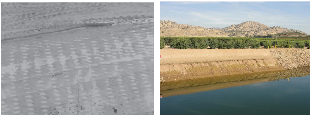
Figure 5: Pictures of the Friant-Kern Canal.

Left : sheepfoot roller imprints filled with water, at the canal bottom after 1 year irrigation (source : National Lime Association).