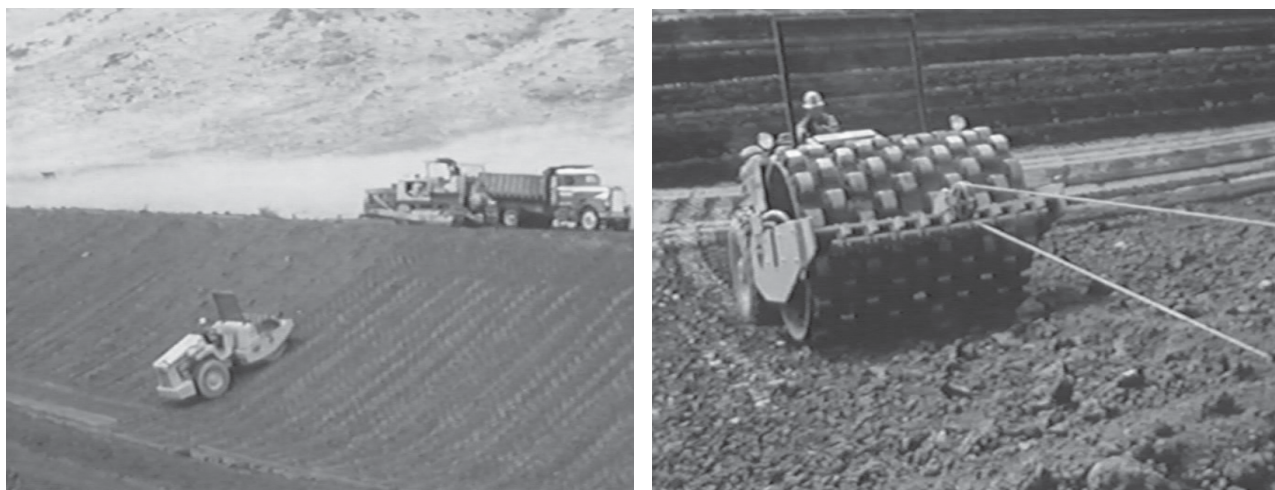
Figure 4: Compaction procedure on the canal banks (First project).

A “yo-yo” fashion was adopted; the compaction was performed by a sheepfoot roller (kneading compaction).