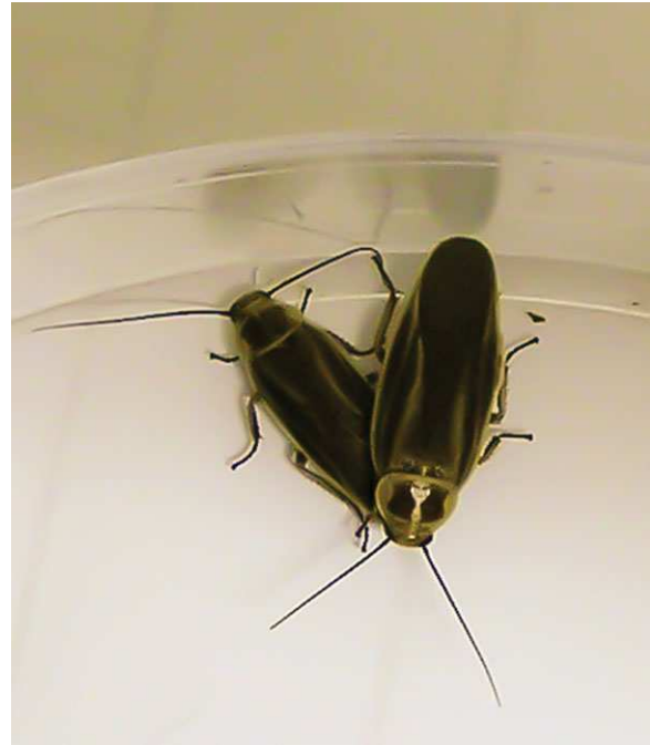
Figure 1. Male (left) and female (right) Schultesia nitor .

copulation (e.g., N. cinerea ; Roth 1962, 1964a). Monandry can also arise from abiotic constraints. In Pieris napi for instance, females exhibit two mating strategies: they can either be polyandrous or monandrous. Although these differences are under genetic control (Wedell et al. 2002b), monandry in this species has been shown to be selected in populations facing unfavorable weather conditions (Välimäki et al. 2006).