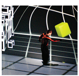
(b) Scenes 3-4-5: Manipulating a virtual cube.