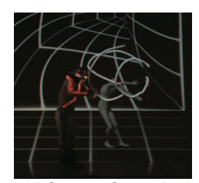
(e) Scene 7: Generation in real time of 3D ribbons from dancer's hands