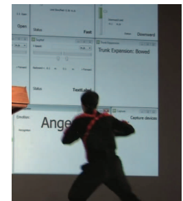
(a) The motion capture suit.