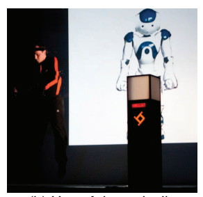
(b) Use of dynamically triggered videos.