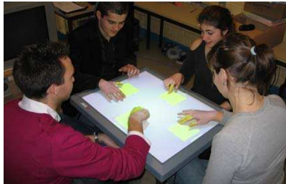
Fig. 1. Example of a tabletop system using MERL DiamondTouch device [5].

Tabletop systems (see Fig. 1) are multi-user horizontal interfaces for interactive shared displays. They implement around-the-table interaction metaphors allowing co-located collaboration and face-to-face conversation in a social setting [12, 13].