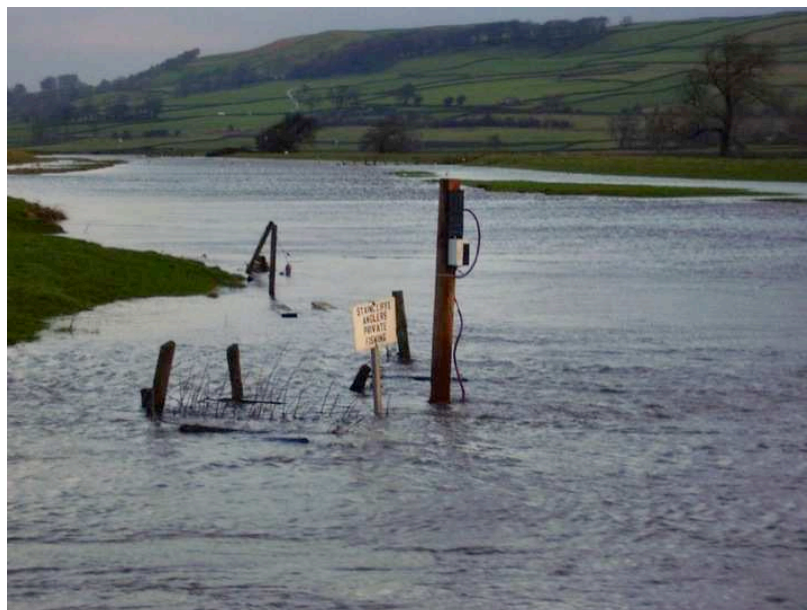
Figure 1. A GridStix node next to the River Ribble

GridStix [3] is a flood warning WSN deployed on the Rivers Ribble and Dee in England and Wales respectively (Figure 1). GridStix uses Linux boards with depth and flow sensors deployed over a c. one-kilometer stretch of river. Power is supplied by batteries, replenished by solar panels. Nodes are equipped with both 802.11b (WiFi) and Bluetooth communications for inter-node data transmission, with a single GSM uplink node.