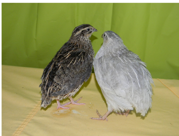
Figure 1 Wild-type (left) and lavender (right) Japanese quail.

All Japanese quail were produced and maintained at the INRA Experimental Unit PEAT in Nouzilly, France (Pôle d'Expérimentation Avicole de Tours, F-37380 Nouzilly, authorization B37-175-1, 2007) in accordance with European Union Guidelines for animal care, under authorization 37-002 delivered to D. Gourichon by the French Ministry of Agriculture. Animal procedures were