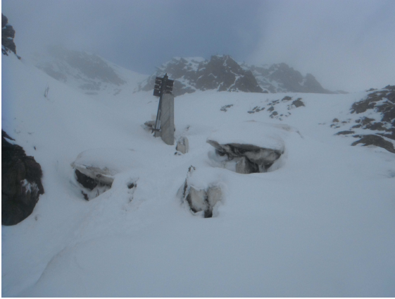
Figure 6: snow blocks around the measured structure.

On this particular day, we discovered a natural deposit around the instrumented structure made of very dense snow packs (too hard to be gouged for a density sample), with huge blocks ( \geq 6 \text{ m}^3 ).