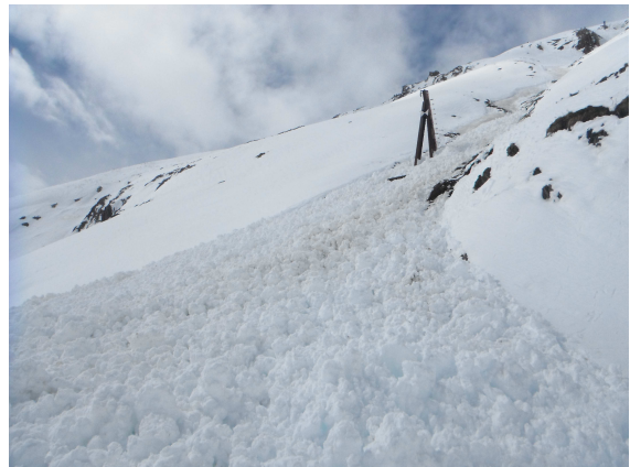
Figure 9: a balls field in the surface of the deposit.

The flow of the avalanche was small, nevertheless it hit the sensor support. It was made of multitude of small balls, around 20 cm in size, which stopped quickly after reaching the sensor support.