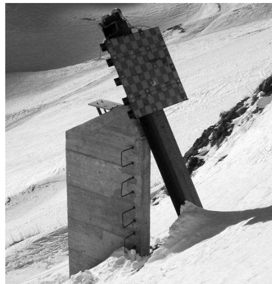
Figure 3: Instrumented structure set up in path n°1. The 1 \text{ m}^2 plate can be moved along the beam to be located exactly at the surface of the snow-cover.

Its length is 500 m with an average slope angle of 36^\circ that reaches 40^\circ in the starting zone. An instrumented structure is set up to measure avalanche impact pressure. It consists of a one square-meter plate supported by a 3.5 m high steel cantilever, facing the avalanche, and fixed in a strong concrete foundation (Fig. 3). The plate can be moved along the beam to be located exactly at the surface of the initial snow-cover prior to avalanche release. It represents a large obstacle in comparison to the flow height and therefore integrates the effects of flow heterogeneities. Strains are measured at the bottom of the beam with precision strain gages placed in the maximum bending moment area. Sampling rate for data acquisition is set at 3000 Hz to record dynamic effects. Signals are filtered with a cut-off frequency of 1000 Hz to ensure a bandwidth without aliasing. This system has provided new results in avalanche impact pressure quantification (Berthet-Rambaud et al., 2008; Thibert et al., 2008; Baroudi and Thibert, 2009).