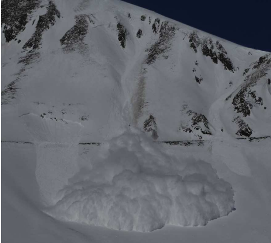
Figure 4: Avalanche artificially released on the 27 February 2007 in path n°2.

pressure sensors. Electronic signals are conveyed to the measurement bunker situated between the two avalanches paths. Preliminary results will be shortly published.