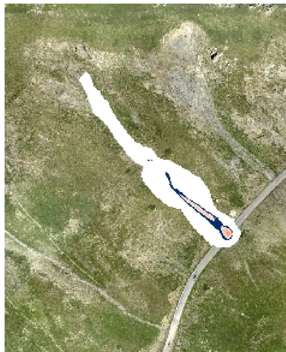
Figure 11: the simulation of the 11 th April 2012 avalanche.

For example, collected field data can be used for a better understanding of the impact force stemming from snow avalanches (Thibert et al., 2008; Baroudi and Thibert 2009). These data are also very relevant and helpful for numerical modeling calibration. Preliminary simulations of the 11 th april event have been already carried out with the Irstea avalanche numerical model based on depth-averaged equations including a Voelmy rheology and an erosion/deposit model (Naaim et al., 2003; 2004)