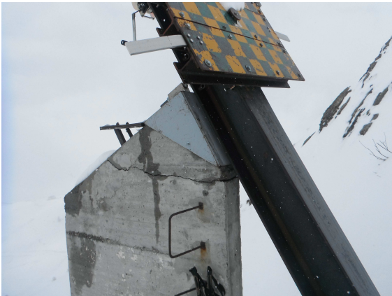
Figure 7: the steel beam twisted.

This day we discovered that the steel beam was totally twisted by the impact and the measuring was impossible.