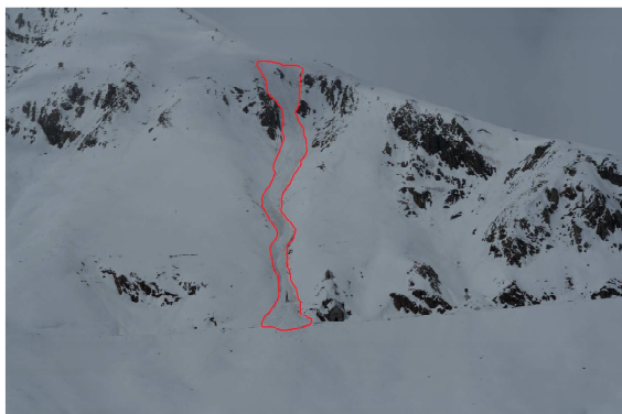
Figure 10 : the 11 th April 2012 avalanche.

For example, collected field data can be used for a better understanding of the impact force stemming from snow avalanches (Thibert et al., 2008; Baroudi and Thibert 2009). These data are also very relevant and helpful for numerical modeling calibration. Preliminary simulations of the 11 th april event have been already carried out with the Irstea avalanche numerical model based on depth-averaged equations including a Voelmy rheology and an erosion/deposit model (Naaim et al., 2003; 2004)