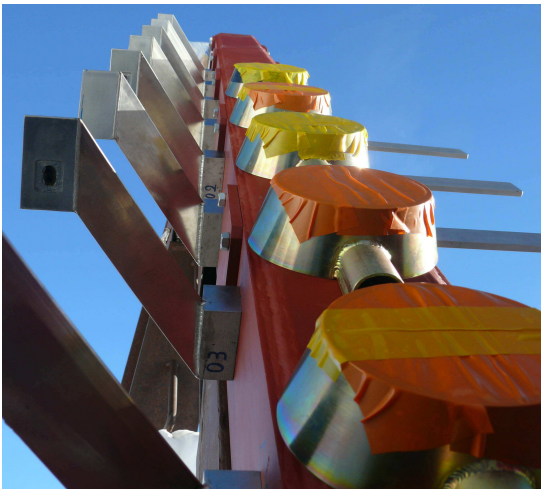
Figure 5: Pressure (right) and velocity (left) sensors set up on the tripod at path n°2.