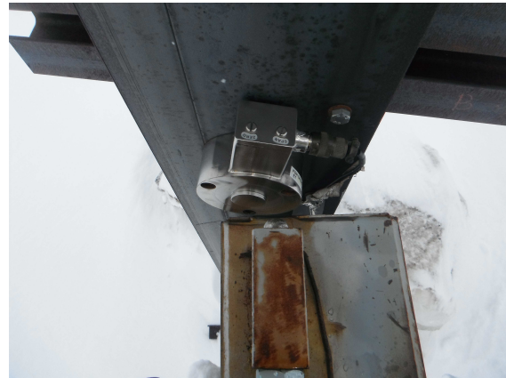
Figure 8: one of the sensor completely eccentric