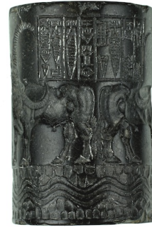
Figure 1. Cylinder Seal of Ibni-Sharrum, Musée du Louvre, AO 22303

The examples used in the paper refer to the following case-study scenario: the “Cylinder Seal of Ibni-Sharrum” (Figure 1). The original artwork is exposed at the Louvre Museum in Paris, France, more precisely in the department of Near Eastern Antiquities. The story of this art piece is interesting and rich enough to give it the title of “masterpiece of glyptic art”. Engraved by Ibni-Sharrum probably during the Agade period, under the reign of Sharkali-Sharri (c. 2217-2193 BC) it depicts two buffaloes that have just slaked their thirst in the stream of water spurting from two vases held by two naked kneeling heroes. In particular, in 2008 a 3D model has been acquired using a multi technique 3D acquisition[17]. We can use a hypothetic database, based on the information stored at C2RMF (Centre de Recherche et de Restauration des Musées de France) where