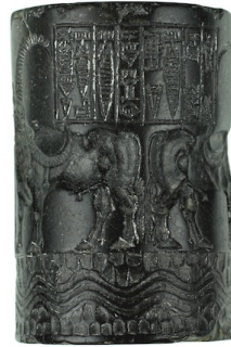
Figure 1. Cylinder Seal of Ibni-Sharrum, Musée du Louvre, AO 22303

The examples used in the paper refer to the following case-study scenario: the “Cylinder Seal of Ibni-Sharrum” (Figure 1). The original artwork is exposed at the Louvre Museum in Paris, France, more precisely in the department of Near Eastern Antiquities. The story of this art piece is interesting and rich enough to give it the title of “masterpiece of glyptic art”. Engraved by Ibni-Sharrum probably during the Agade period, under the reign of Sharkali-Sharri (c. 2217-2193 BC) it depicts two buffaloes that have just slaked their thirst in the stream of water spurting from two vases held by two naked kneeling heroes. In particular, in 2008 a 3D model has been acquired using a multi technique 3D acquisition[17]. We can use a hypothetic database, based on the information stored at C2RMF (Centre de Recherche et de Restauration des Musées de France) where