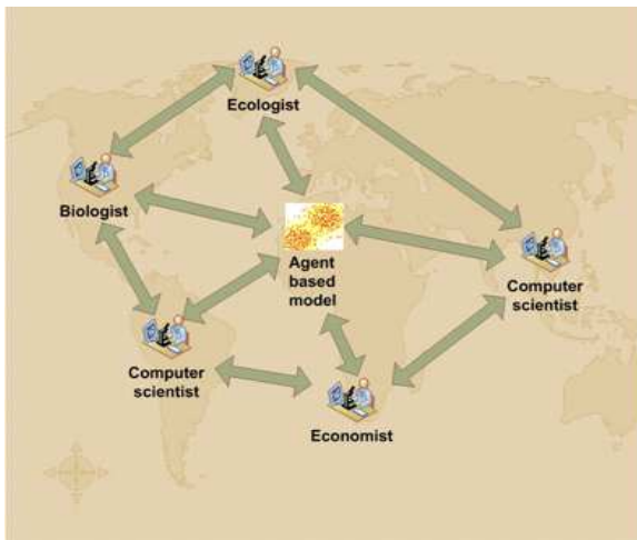
Figure 1: multidisciplinary problem

Because of this multidisciplinary characteristic, the simulation of the complex systems is the activity where the collaboration is highly required and constitutes the usual working way rather than an exception.