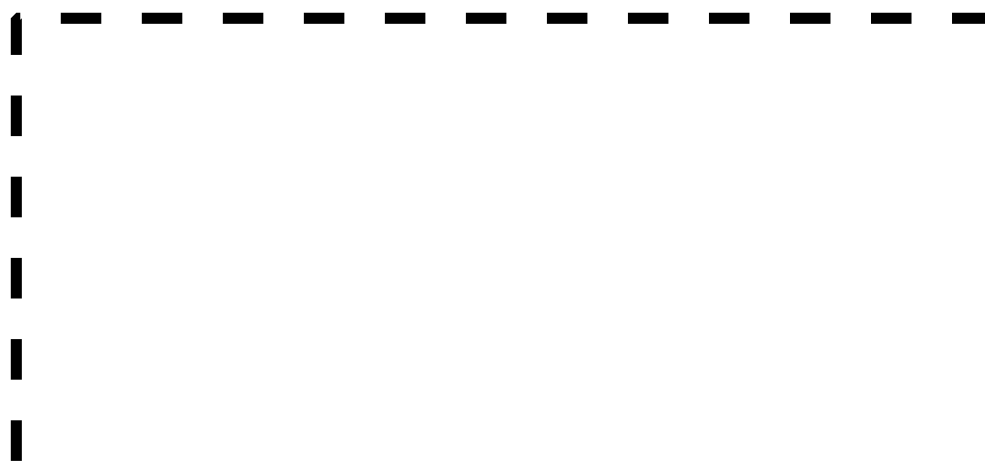
Figure 5. Terminating agents for the cationic ring-opening polymerization of 2-R-2-oxazolines.