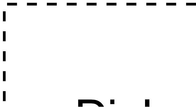
Figure 9. Perspectives concerning the synthesis of functionalized polyoxazolines from precursors bearing appropriate functionality.