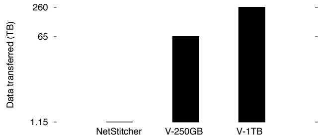
Fig. 3. Comparison between an Internet-based solution (NetStitcher [3]) and the proposed vehicular-based solution (V- 250GB and V-1TB), depicting the amount of data transferable in a delay of 3 hours between two cities in the same timezone.

In this section we compare the vehicular-based bulk data transfer system with an Internet-based bulk data transfer solution named NetStitcher [3] (see also Section V). NetStitcher achieves its best performance by transferring 1.15 Terabytes in 3 hours between cities in the same time-zone. These values will be used as a hard constraint during our comparison