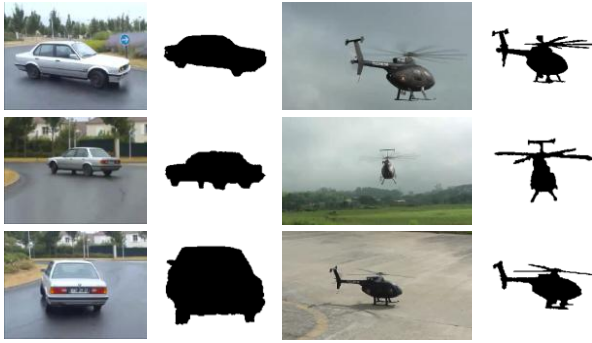
Figure 2: Sample of video frames and extracted objects

The experiments have been carried out on a database of 40 videos selected from Internet and including the following 8 object categories: airplanes, cars, chess pieces, helicopters, humanoids, motorcycles, pistols and tanks. Each category is present in 5 different videos with different appearances, and for each video N_F=3 frames were selected (Figure 2).