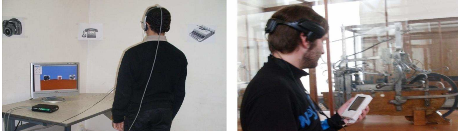
Figure 2: (left): User holding the PP sensor, looking towards the objects of the real scene; his field of vision is reproduced on the interface. (right): Experimenting with the PERCIPIO headset at the CNAM museum

seemed to be difficult. For this reason, the system is provided with the ability of adjusting the maximum number of audio objects to be perceived.