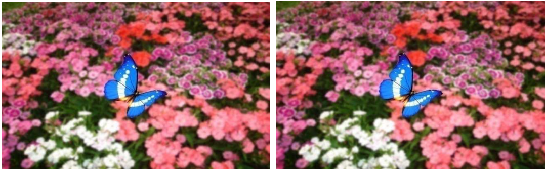
Figure 2. The left views of an sharp-background stimulus and a blur-background stimulus

foreground and background. Two sources of perceived depth are used: disparity and blur. The perceived depth from disparity stems from the difference of disparity between the foreground object and the background. The perceived depth from blur stems from the amount of blur introduced to the background by convolution with a Gaussian kernel (Figure 2). Both the absolute position and relative distance between the foreground and background stay as a free parameter (Figure 1). This setup is able to evaluate how the combination of disparity and blur affects the perceived depth of objects located at different distance. Details of the experiment are described in [9].