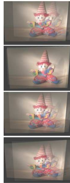
(b) Four pictures associated to four steps of the algorithm using two input cameras.