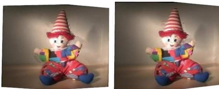
Figure 3: Two real-time images from three input cameras (20 fps with 30 planes).