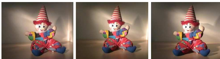
Figure 2: Three input calibrated images.

We have presented in this article an adaptation of an image-based method using a small set of input images whereas other methods require a large set. The final image is quite realistic compare to the real model. Moreover, since the computation of an image does not depend on the previous generated images, our method allows the rendering of dynamic scenes for a low resolution final image. This method can be implemented for every consumer graphic hardware that supports fragment shaders and therefore frees the CPU for other tasks. Since our scoring method takes into account all input images together and reject outliers, our method handle occlusions. Finally, our scoring method enhances robustness and implies fewer constraints on the position of the virtual camera, i.e. it does not need to lie between the input camera's area. We propose to extend our research on a stereoscopic adaptation of our method that compute the second view for low cost.