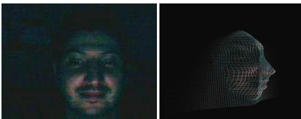
Figure 6. 3D geometry surface recovery: (left) input image, (right) 3D surface.

For more accuracy, the subject should be far from the camera to produce an orthographic projection. A distance trade-off is made such the subject can receive enough light from the screen. Figure 6 depicts some 3D reconstruction performed in real-time.