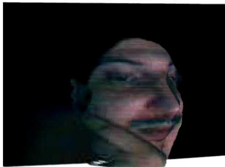
Figure 1. 3D facial reconstruction.

proximated by the intersection of the projected silhouettes. The plane-sweep algorithm can compute a 3D reconstruction of the scene in real-time [9] using a discretisation of the scene with parallel planes.