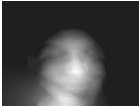
Figure 5. Depth map.

As suggested by [11], we choose to solve this equation using Gauss-Seidel method. Indeed, even if an iterative method does not guarantee the best accuracy, it presents the advantage to accept as an initial solution the depth map of the previous frame, which leads to a fast convergence. Moreover, Gauss-Seidel relaxation is very well suited to be implemented on GPU since every pixel can be processed simultaneously. Finally, to ensure a constant reference depth for all the reconstructions, the relaxation process is not applied on the corners of the depth map (Figure 5).