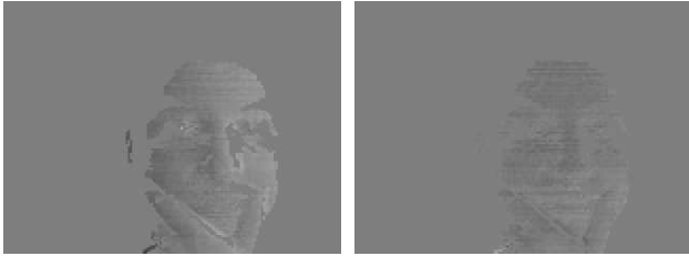
(a) X component (b) Y component Figure 4. Example of normal surface map.

Since every input image is different, the SVD of A^T A will provide N orthogonal eigen vectors. The eigen vector associated to the biggest eigen value corresponds to the z-axis. The two next biggest eigen values correspond to two others orthogonal directions. Since we arranged our light system to be oriented only in vertical and horizontal directions, these two eigen values will correspond to the x and y image axis. We can identify which of the two eigen vectors corresponds to the x and y axis by comparing the provided coefficient for every input image. The x axis eigen vector will provide a high coefficient for the images associated with the left and right lighting while the y axis eigen vector will give high values for the top and bottom lighting. To check the identification, the i^{th} component of the x, y and z eigen vectors should correspond to the light orientation of the image of the i^{th} line of A .