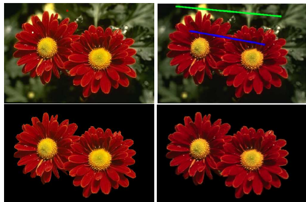
Fig. 1. User scribbles for background/foreground discrimination with the proposed method (left: white/red points) and a recent method [1] (right: blue/green segments).

In this paper, the approach is based on the use of points drawn on the image by the user. However, contrary to the vast majority of state-of-the-art approaches [1, 2, 3], the method does not need segments of pixels. Indeed, selecting sample points is generally enough to obtain a convenient segmentation, as illustrated in Figure 1, where two points are sufficient to obtain the segmentation. Our approach is based on a new representation of color images through the color monogenic signal (CMS), which carry both color and structure information. With the help of angular and norm values of this signal, a weight for each pixel is built, and is used to compute geodesic