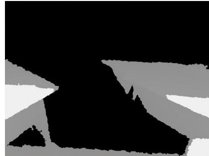
(b) The depth map