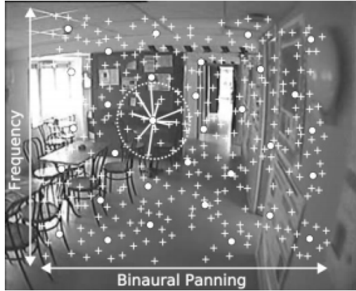
Figure 3: Example of retinal encoding applied to a gray-scaled image according to B. Durette. Crosses are pixels p used for the calculation. Filled circles are centers of the receptive fields.

In Figure 3 an example of this approach is shown for a gray-scaled intensity map. Extracted pixels (white crosses) are grouped in receptive fields (RFs) and associated to a neuron, as shown by the dotted line circle. Previously, Durette's work use 50 to 100 RFs per image, whereas we used 64 RFs uniformly distributed over the image field.