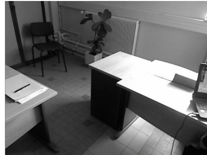
(a) Input gray image

Figure 4 summarizes an example of retinal encoding with 64 RFs, as it is implemented in our system.