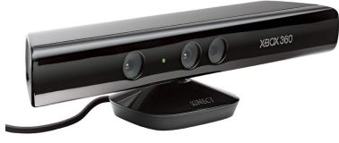
Figure 2: Kinect®sensor

To implement the image-processing program in Window 7 environment, we used libfreenect library ( openkinect.org project) as a low-level API to read Kinect's depth image.