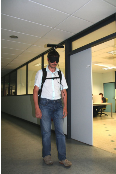
Figure 6: A blindfolded participant walking in an office corridor.