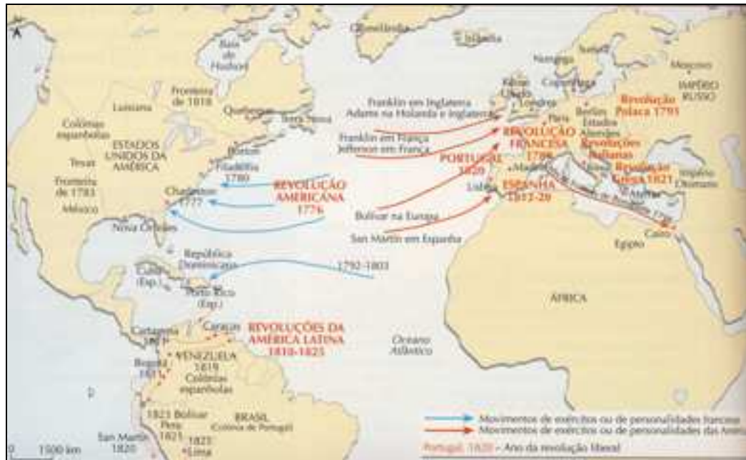
Figure 1. "The Liberal Revolutions in Europe and the Americas" (1776-1825) (RH8: 114)