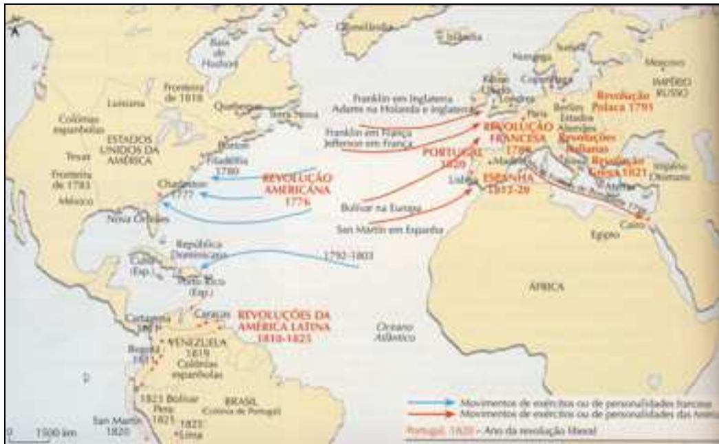
Figure 1. "The Liberal Revolutions in Europe and the Americas" (1776-1825) (RH8: 114)