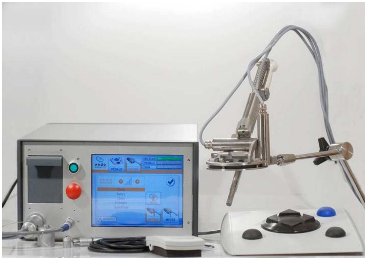
Figure 1: The robotic system including the console, the robot and the pedal.