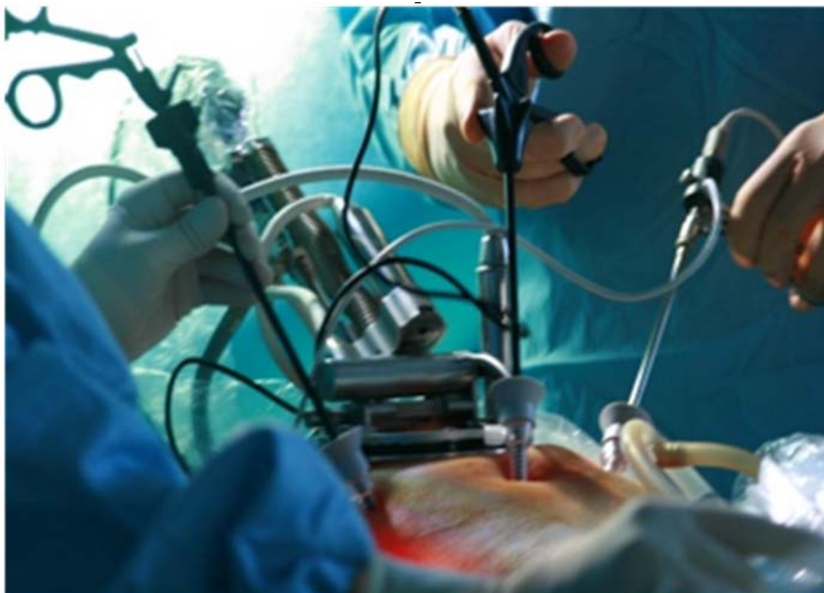
Figure 3: The robot in the operative field