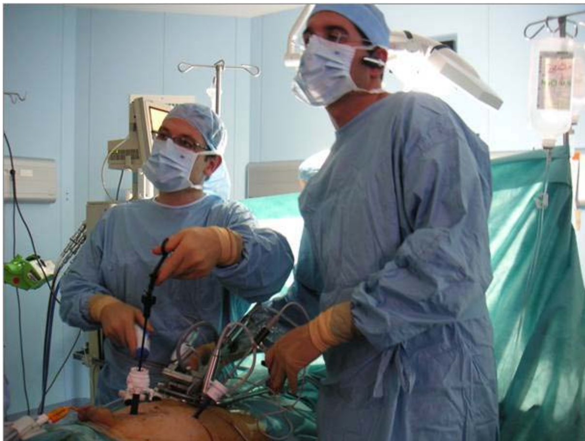
Figure 2: The robotic system in use. Pay attention to the headset device allowing voice recognition.