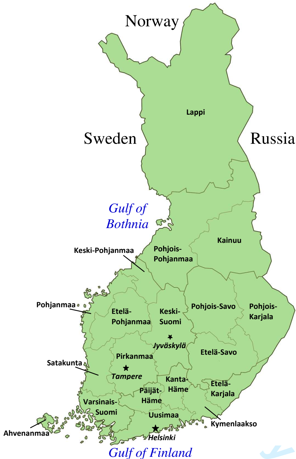
Fig. 1. Finnish regions

Note: Prior to 1 January 2011, the eastern part of Uusimaa, Itä-Uusimaa, was a separate region. The map depicts the new boundaries.