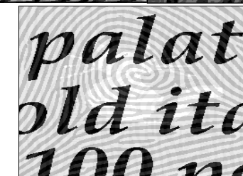
Fig. 3. The observation images

The reconstructed images are shown in Fig.4. We used \text{SNR} = 20 \log(\|X\| / \|X - \hat{X}\|) , where X is the input image, \|\cdot\| stands for the Frobenius norm of a matrix, as performance measure. The following table shows the ability of our method to source separation in images.