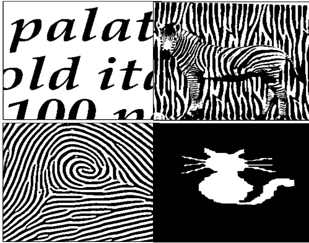
Fig. 4. Separated images using \ell_1 minimization

ies. The difference with our linear underdetermined source recovery process is that we add observations to our encoding measurements ( \mathbf{B}_1 \mathbf{s} = \mathbf{1}_N^T ). Without this step, the recovery algorithm of finite alphabet signals fails.