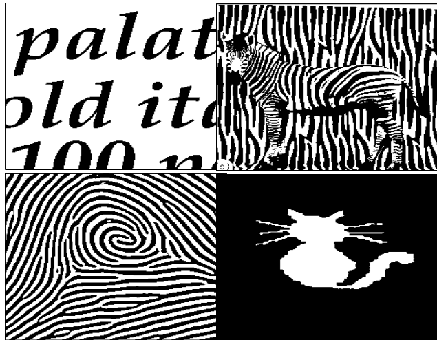
Fig. 2. The Original binary images

We execute our vectorial procedure by stacking the pixels of the four sources in a one-dimensional signal.